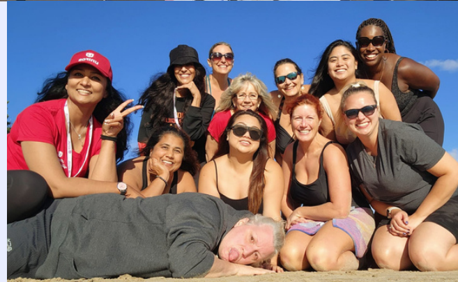
LOCAL 2169 CONFERENCES